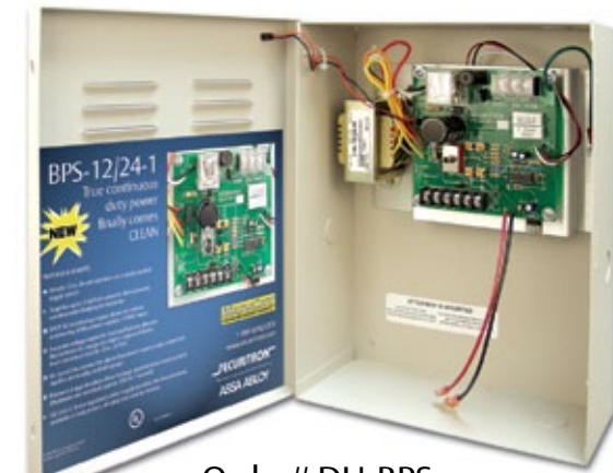
Order# DU-BPS 12" x 9" x 4", 9 lbs., List $290.00