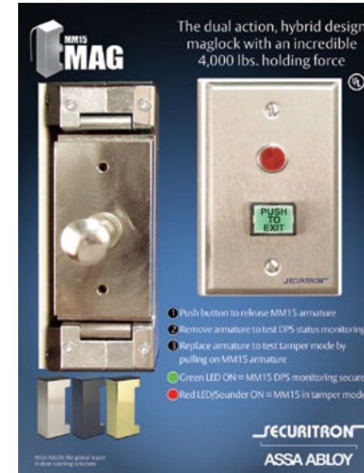
Order# DU-MM15 8.5" x 11" x 5.5", 4 lbs., List $490.00