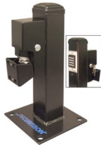
Order# DU-GL1 8" x 8" x 17.5", 16 lbs., List $430.00