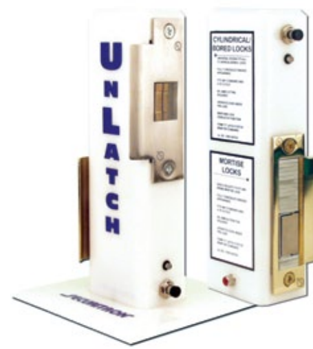
Order# DU-UNLATCH 5.625" x 5.625" x 9.5", 3 lbs., List $900.00