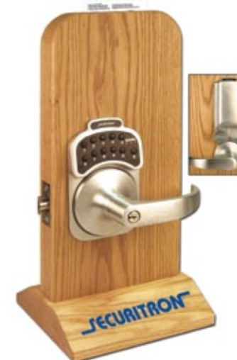
Order# DU-SABL 7.5" x 18" x 17", 14 lbs., List $760.00