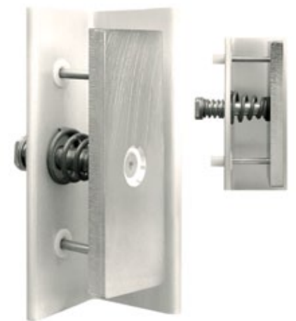
Order# DU-SASM 3" x 4" x 8", 3.5 lbs., List $115.00

These items can be ordered from Securiton by calling 1-800 MAGLOCK (624-5625). Please allow 30-60 days for delivery.