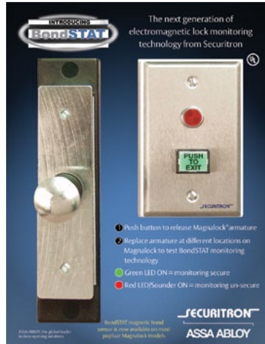
Order# DU-MBS 8.5" x 11" x 4", 6 lbs., List $460.00