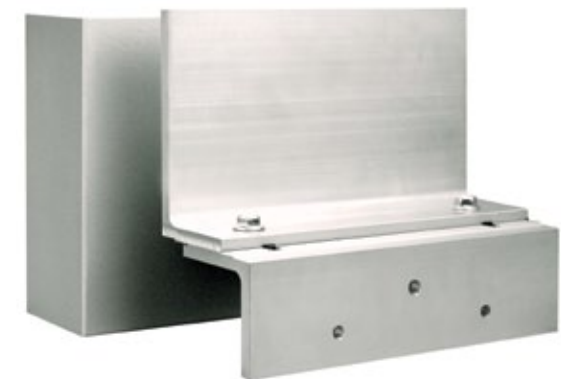
Order# DU-ZA 8" x 9" x 3", 5 lbs., List $130.00