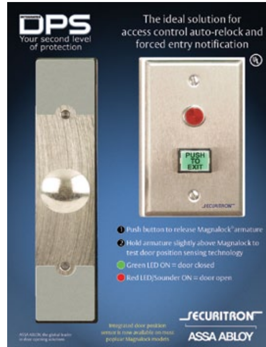
Order# DU-DPS 8.5" x 11" x 4", 6 lbs., List $430.00