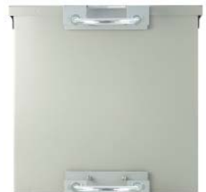
PMK-3 - Optional Large Pole Mounting Kit