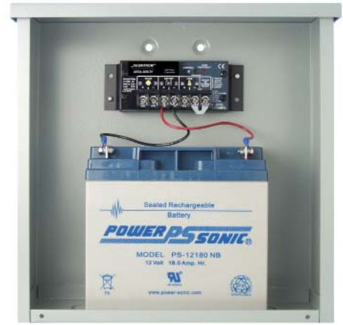
BPSS NEMA-3R Wall Mount Cabinet with Solar Controller