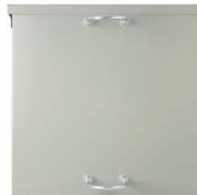
BPSS with included Pole Mounting Kit