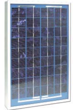
BPSS-10W Solar Panel