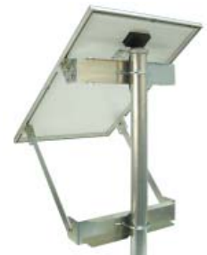
SWK - Optional Solar Panel High Wind Kit for 20W Panel