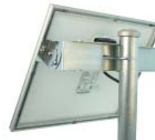
Included Solar Panel Mounting Kit