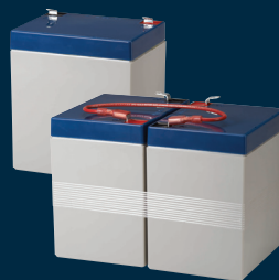
B-12-5 / B-24-5 Lead Acid Battery