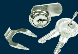
CKL Cabinet Key Lock